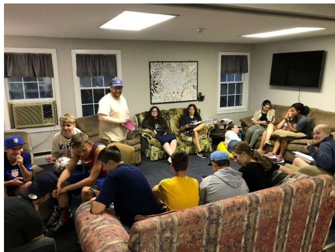
Teens Reflecting on and Discussing Luke 9:28-36 September 15, 2024