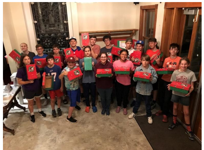
Teens Displaying "Operation Christmas Child" Boxes - October 2024

Our TAG youth group will be meeting on the following Sundays from 6:00-8:00: October 27 th , November 24 th , and December 8 th . Please keep all the teens of our group, and in Bergen, in your prayers. Continue to pray for God's protection and guidance in their lives!